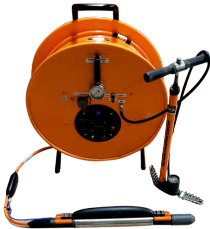
Borehole geophone BGK with cable drum, pneumatic clamping mechanism using an inflatable bladder and a standard bicycle pump and magnetic compass display.

The borehole geophone BGK series is used to receive P- and S-waves in dry or water filled boreholes. The borehole geophone BGK3 consists of a tri-axial sensor whereas the BGK7 consists of six horizontal sensors, separated by 30° intervals, and one vertical sensor. The geophone is coupled to the borehole wall by a pneumatic clamping system (inflatable bladder). Air is supplied to the BGK through an electro-pneumatic hybrid cable with a Kevlar tension string. A magnetic compass shows azimuthal deviation to North and can be used to get the orientation of the geophone in the borehole. The cable is terminated by a connector to the seismograph.